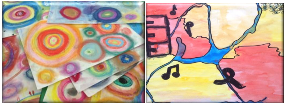
My Soul Bird opens the drawer of happiness and everything lights up into thousands of bright colours